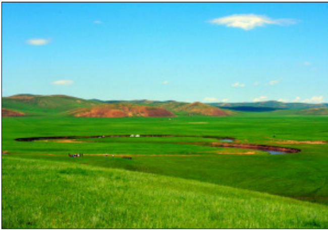
Hulunbeier grassland, Inner Mongolia

In late afternoon, we travel south through the huge grasslands for about an hour and arrive at Bayanhushuo Yurt Camp . Here the meandering Yimin River runs through the undulating meadows with lush trees and bushes dotting the river banks, an ideal location for an overnight in nature. You will sleep in traditional style Mongolian Yurts (Ghers), dwellings of nomadic Mongols. Enjoy Mongolian dance and music by bonfires after dinner under the stars at the camp. Bayanhushuo Yurt Camp <B-L-D>