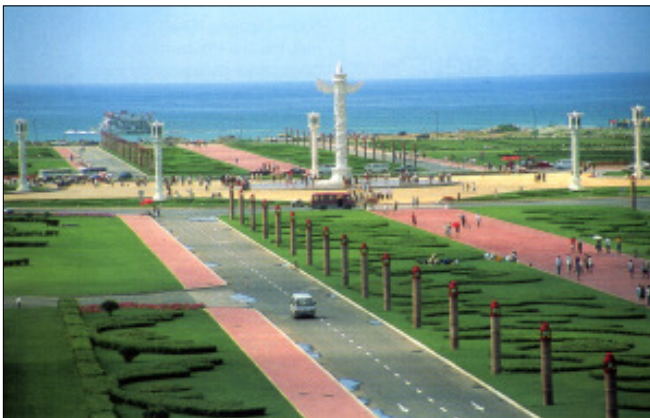
Xinghai Square by the ocean, Dalian

On your way to Shenyang Airport this morning, visit