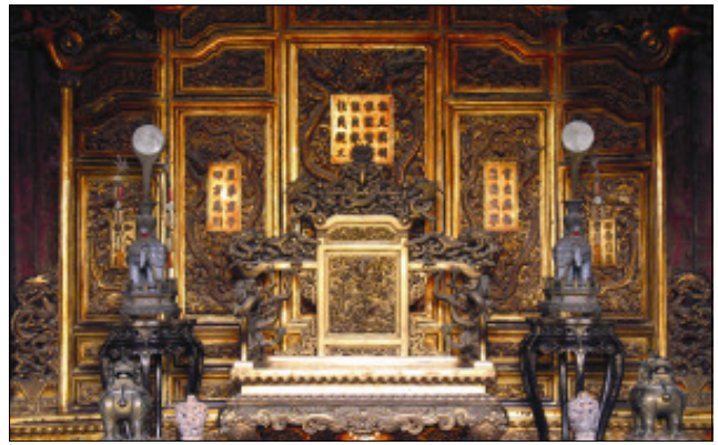
The Throne in Shenyang Imperial Palace Museum

Shiyunshan Manchu Village and Folk Museum for a better understanding of Manchu history, culture and customs. Fly to Dalian (called " Port Arthur " in the old days by Europeans and Americans) and arrive in early afternoon.