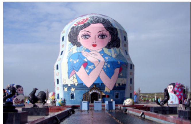
Chinese-Russian style new monument in a Manzhouli public square, Hulunbeier

In the afternoon, visit a Japanese Tunnel built during their occupation in the Second World War, the Hailaer Forest Park for an endemic local species of pine tree "Zhangzison", and the Museum of Ewenke Ethnic Culture .